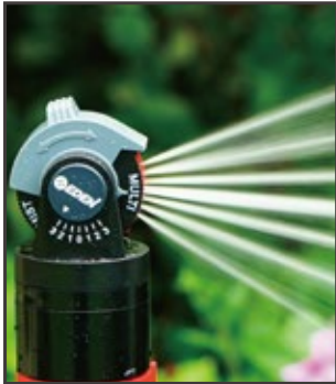
LOWER LEVEL (3-1):

Adjust the spray in between a dispersed and concentrated watering area.