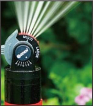
HIGHER LEVEL (1-3):

Move the angle cap to control the distance of your watering area. The higher level will create a higher arc for greater water coverage. The lower level will reduce the watering area. Convenient indicators help you remember your settings for next time.