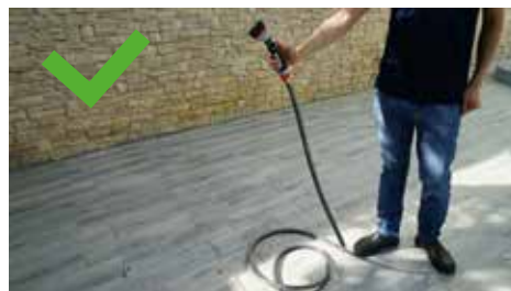
No more twists or kinks