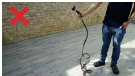
Twisted and kinked hose