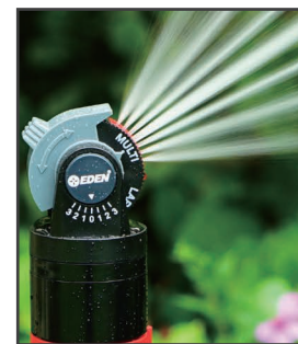
LEVEL (0) Adjust the spray in between a dispersed and concentrated watering area.