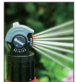
LOWER LEVEL (3-1) Adjust the spray downwards to reduce the watering area.