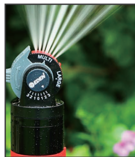
HIGHER LEVEL (1-3): Adjust the spray upwards for maximum distance.