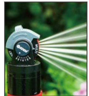
LOWER LEVEL (3-1) Adjust the spray downwards to reduce the watering area.