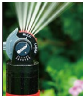
HIGHER LEVEL (1-3): Adjust the spray upwards for maximum distance.

Move the angle cap to control the distance of your watering area. The higher level will create a higher arc for greater water coverage. The lower level will reduce the watering area. Convenient indicators help you remember your settings for next time.