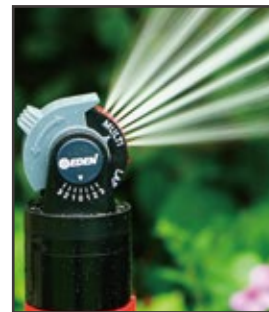
LEVEL (0) Adjust the spray in between a dispersed and concentrated watering area.